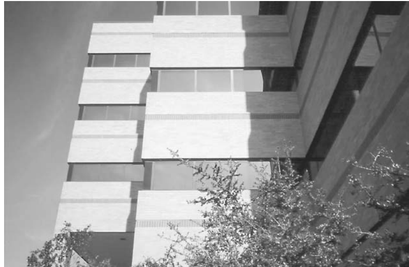
Figure 10-65 Strong horizontal color bands disguise wide soft joints at shelf angles.